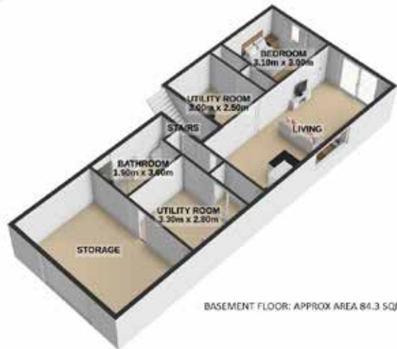
BASEMENT FLOOR: APPROX AREA 84.3 SQM