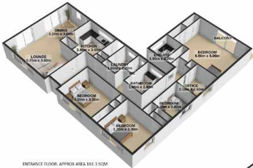
ENTRANCE FLOOR: APPROX AREA 161.3 SQM