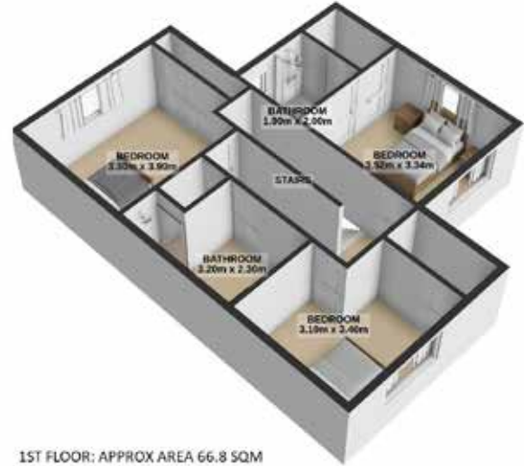
1ST FLOOR: APPROX AREA 66.8 SQM