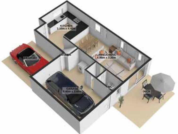
GROUND FLOOR: APPROX AREA 66.4 SQM

Total approx. floor area 133.2 sqm Floor plans have been created for marketing purposes only. Floor areas include garages unless stated otherwise. Whilst all care has been taken to ensure information is correct, we do not take responsibility for any inaccuracies. Floor plans cannot be reproduced without the written consent of Photo Plan.