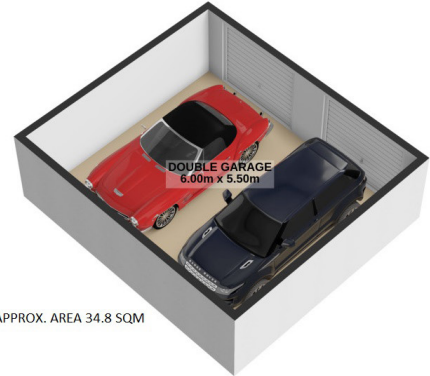
1ST FLOOR: APPROX. AREA 34.8 SQM